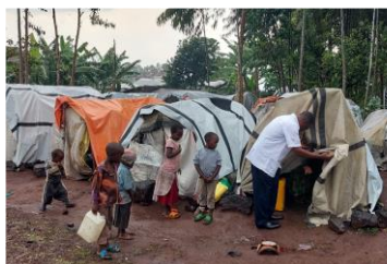
Displaced people and children