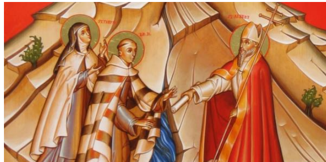
St Albert hands over the scroll containing the Rule of Life