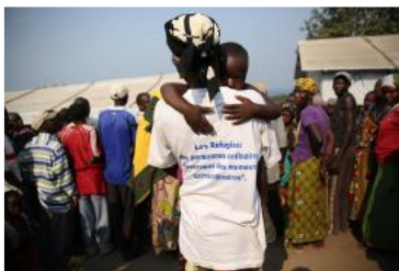
Displaced people and children