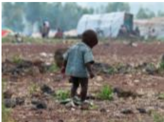
Displaced children in Goma