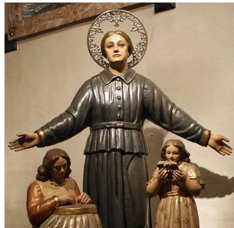
"Souls, souls for God"

24 Thu. Bl. Josepha Naval Girbés (virgin) (Secular Carmelite)