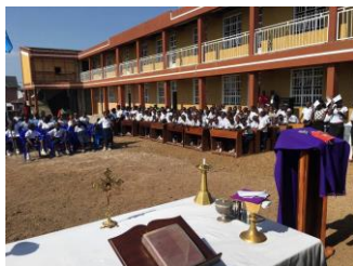
Christmas with the children at Way of Perfection School (2016)