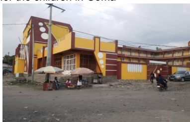
Another view of the school