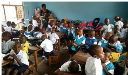
The children in class