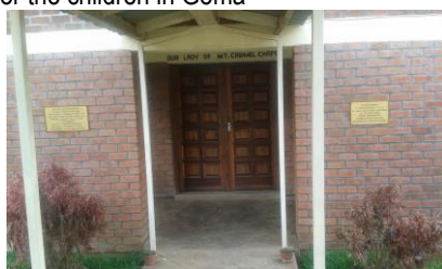
Our Lady of Mt Carmel Chapel