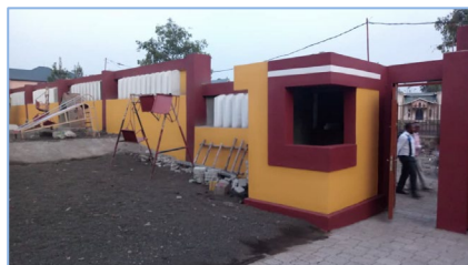
Provision of two grottos at the school, for St Teresa and Our Lady of Mt Carmel