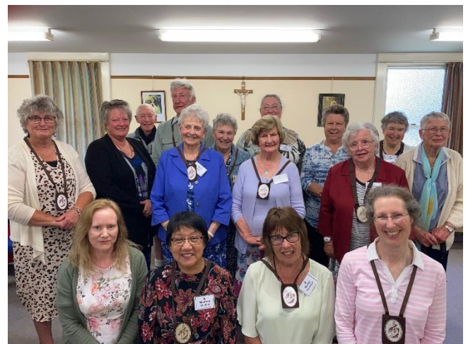
First community meeting for the year, 7 February 2021