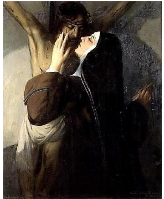
Our Lenten Journey with St Teresa of Jesus: Look at Him...