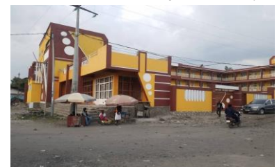
Way of Perfection School

The Seal of Carmel: "Zelo zelatus sum pro Domino Deo exercituum"