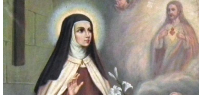
St Teresa Margaret Redi of the Sacred Heart

...She determined to present a smiling and serene exterior no matter how severe her interior and exterior trials. She practiced the art of never doing her own will for she believed that "she who does not know how to conform her will to that of others will never be perfect." She would never offer an excuse for a fault or defend herself when falsely accused. She wrote that "everything can be reduced to interior movements, where the constant exercise of abnegation is essential." She believed that God would be found when God alone is sought. To that end she made the following resolution: "I propose to have no other purpose in all my activities, either interior or exterior, than the motive of love alone, by constantly asking myself: 'Now what am I doing in this action? Do I love God?' If I should notice any obstacle to pure love, I shall take myself in hand and recall that I must seek to return my love for His love..." [ Link ]