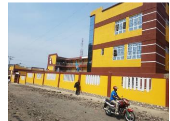
Way of Perfection School

The Seal of Carmel: "Zelo zelatus sum pro Domino Deo exercituum"