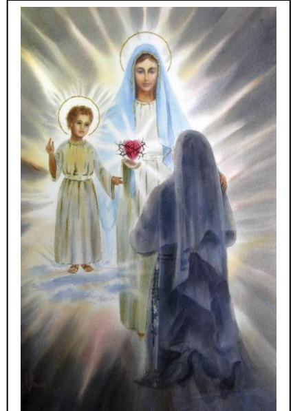
Apparition of Our Lady to Sr Lucia of Fatima

Three days later, another celebration – the Feast of Our Lady of Mount Carmel. It was kept low-key this year, but nevertheless, celebrated in a beautiful Mass at the Carmelite Monastery.