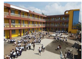
The children at school

The Seal of Carmel: "Zelo zelatus sum pro Domino Deo exercituum"